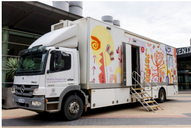
RSS Mobile Dialysis Truck

Adelaide Local Health Network are also supporting the event by dialysing two interstate patients who usually would dialyse in their homes at the Hampstead Home Dialysis Unit.